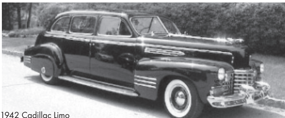
1942 Cadillac Limo