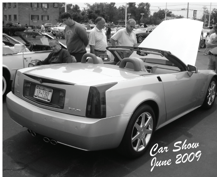
Car Show June 2009