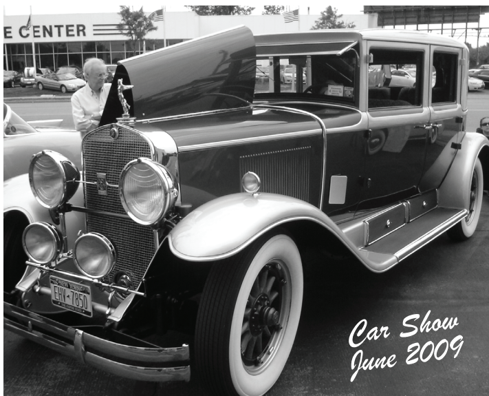
Car Show June 2009